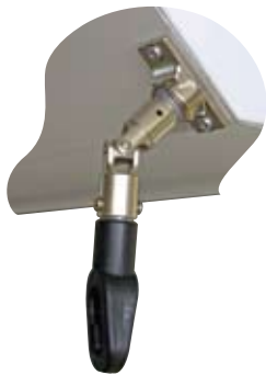
Internal emergency manual override