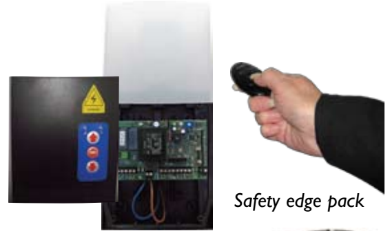
Safety edge pack