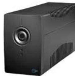
Battery backup – effort-free emergency door operation for normal operation during mains outages