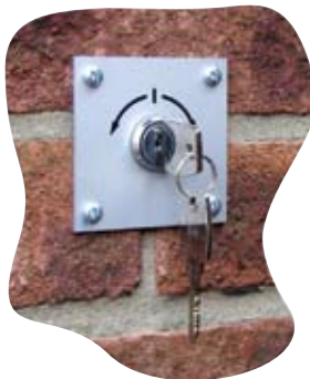
External emergency manual override with security lock and folding crank