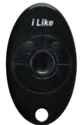
Standard remote control (left) and optional remote control (above)